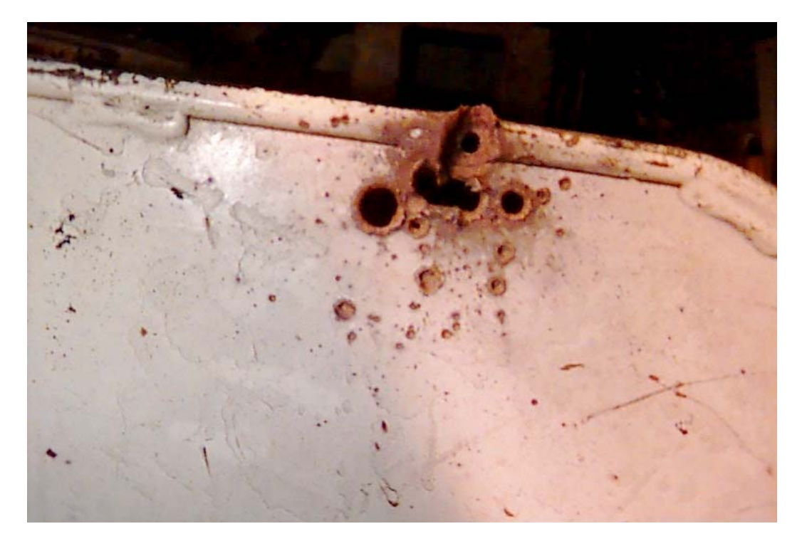
And here is the exit side, please notice the residue of what appears to be copper or bronze. This can be seen in several places:

He says he is not even bruised. The "something" then crossed under the breech and hit the safety guard. Here is the entry side: