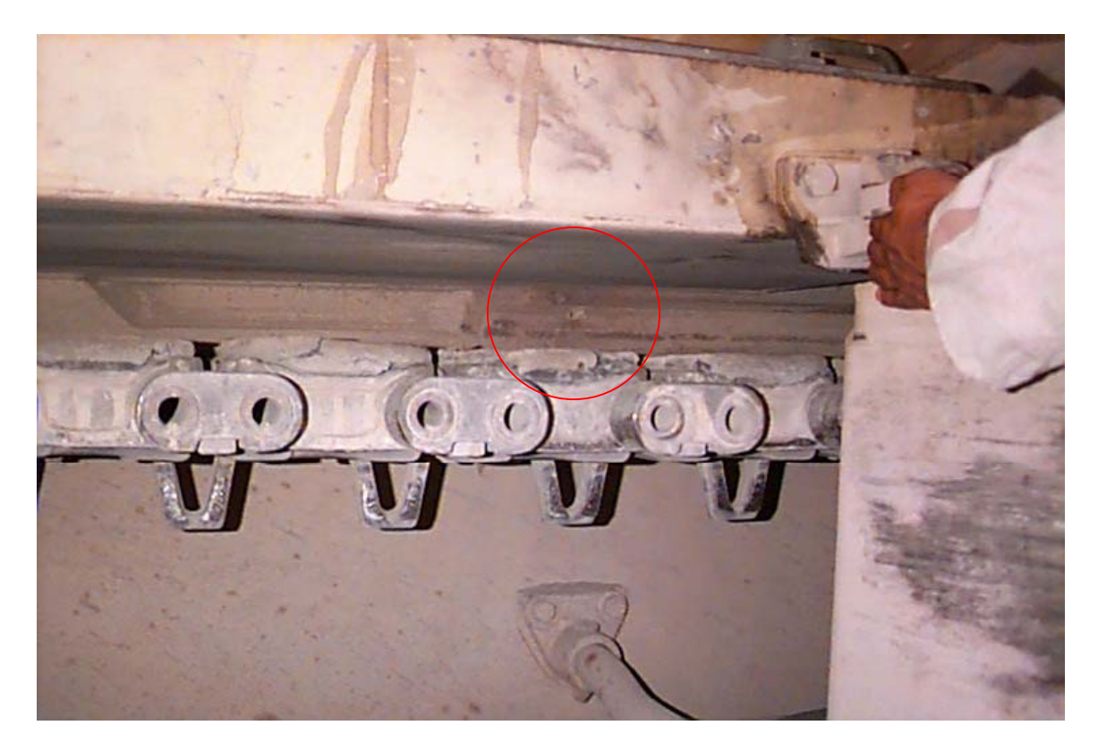
The soldier is holding his hand over the exit hole in the skirt. Here's a close-up of the hole: