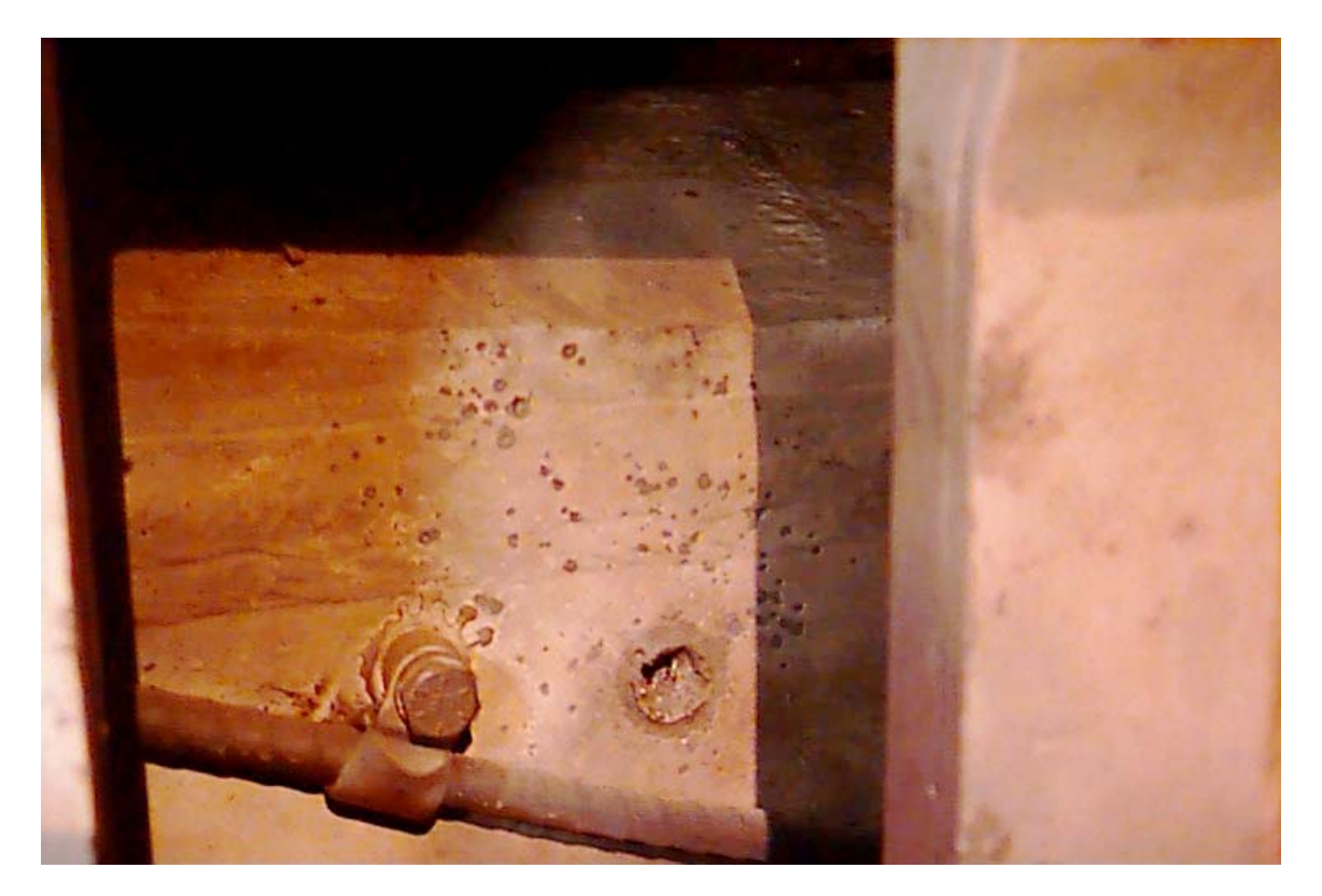
Where it dug a hole one and a half to two inches deep.

h. Other Pertinent Information: The unit is very anxious to have this "SOMETHING" identified. It seems clear that a penetrator of a yellow molten metal is what caused the damage, but what weapon fires such a round and precisely what sort of round is it? The bad guys are using something unknown and the guys facing it want very much to know what it is and how they can defend themselves against it. Can someone tell us? If not, can we get an expert on foreign munitions over here to exam this vehicle before repairs are begun? Please respond quickly.