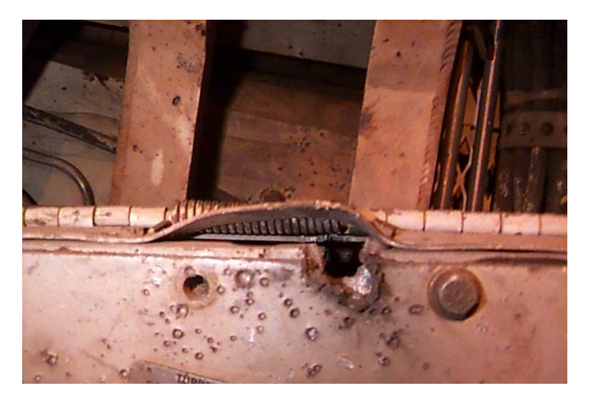
Through the Circuit Breaker Panel: